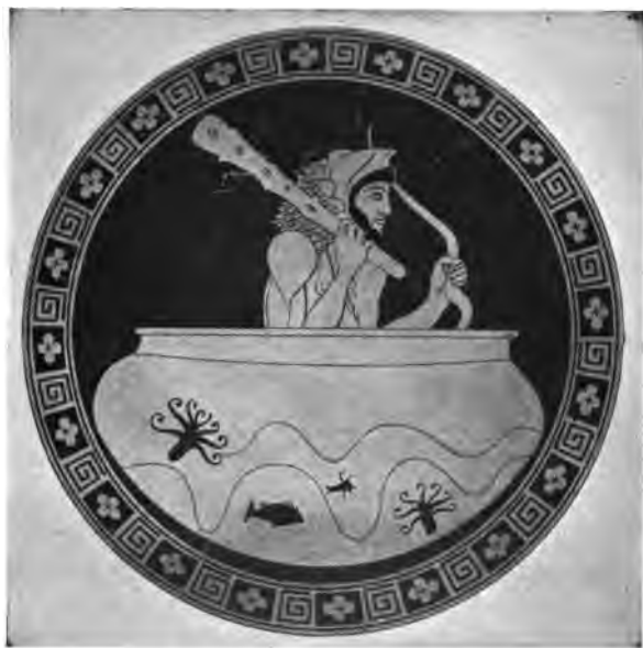
Fig. 70. Heracles in the bowl of the Sun.

monument of his feat. On arriving at the country of Geryon he was attacked first by the dog and then by the herdsman, but he killed them both, and finally, after a terrific struggle, crushed Geryon himself and drove off the cattle. Just